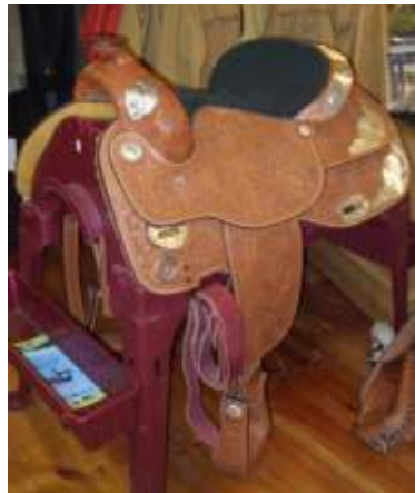
A 16" Silver Supreme Western Show Saddle Retail Value: $1795.00 Saddle provided courtesy of